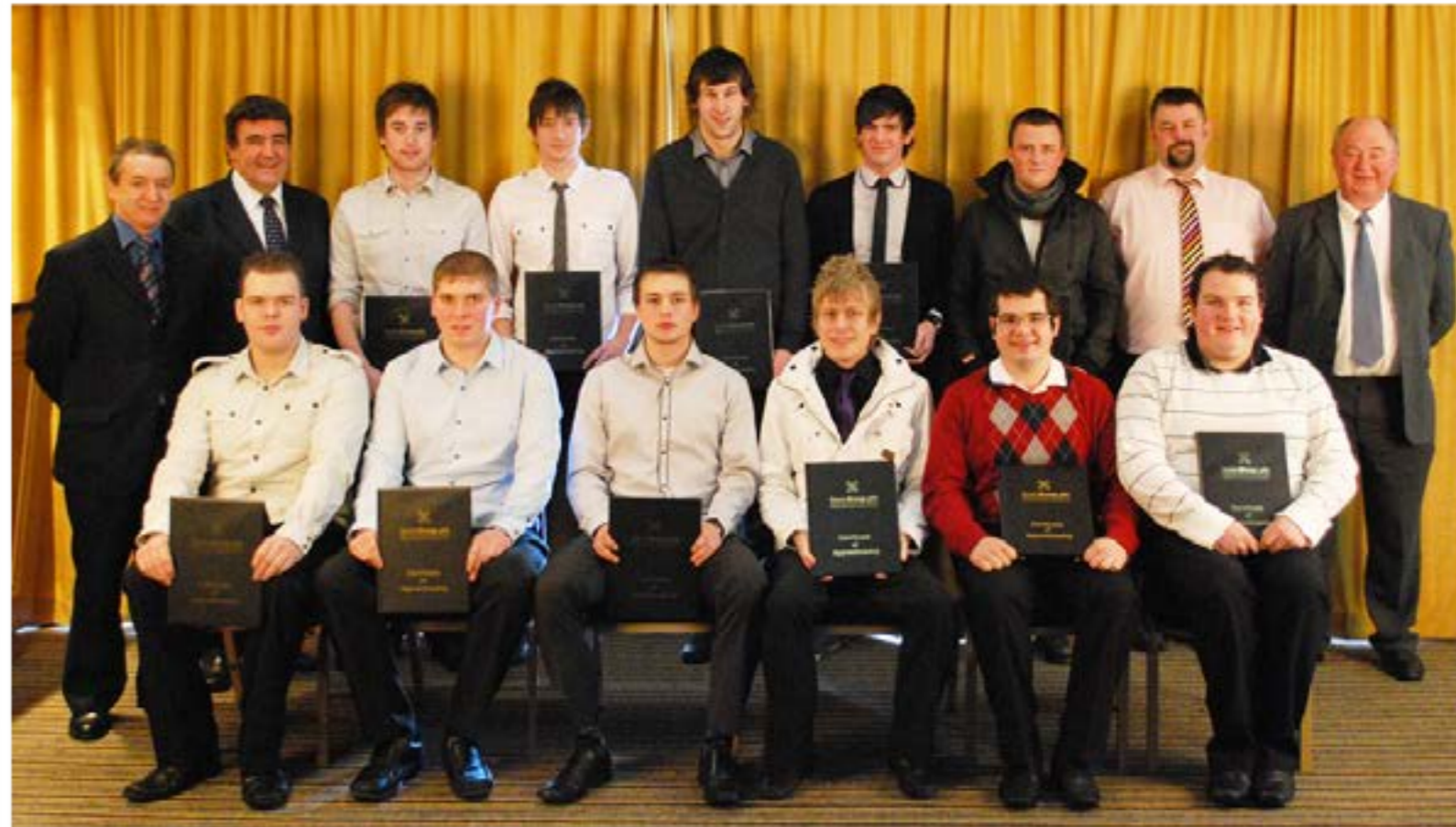
Time served Apprentices of 2010