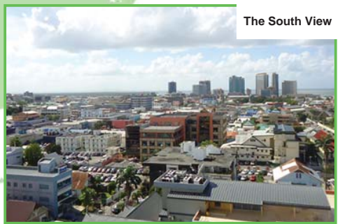
The South View