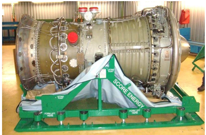
Engine in transportation cradle (2)