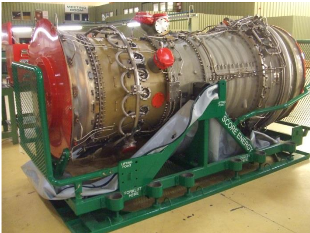
Engine in transportation cradle (1)