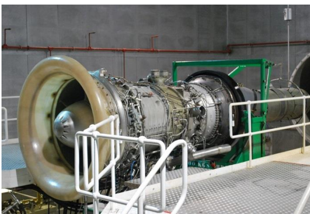
Engine within test cell (1)